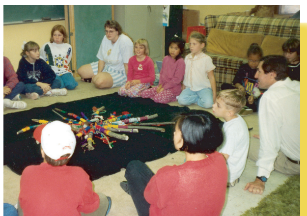
The Talking Sticks are connected into a "star" shape: while each individual Talking Stick design creates a beautiful design.

For Your Next Educational, Cultural or Self/Community Enrichment Program, Contact: Dawn at 608.256.7808 ext. 22