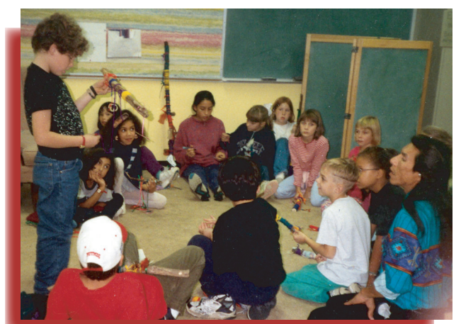
Sharing the meaning of their Talking Stick with the group.

Participants learn how to use the Talking Stick and the Talking Circle to resolve interpersonal, inter-group, intra-group, and other conflicts in a nonviolent manner. The activity works to empower participants using kinesthetic, visual/spatial, linguistic and naturalistic styles of learning, as well as through positive communication based on respect: everyone has a voice, all voices are unique and all voices are important. The Talking Stick ensures that no one voice will prevail over others.